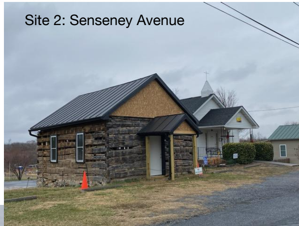
Site 2: Senseney Avenue