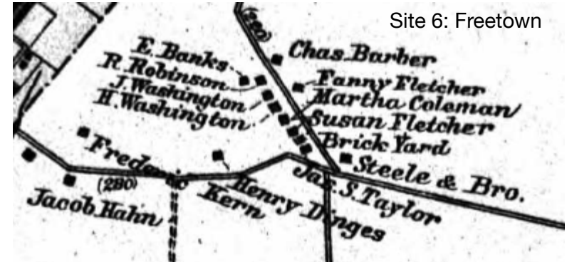
Site 6: Freetown