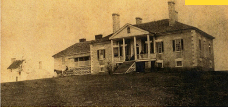
Site 3: Belle Grove Plantation