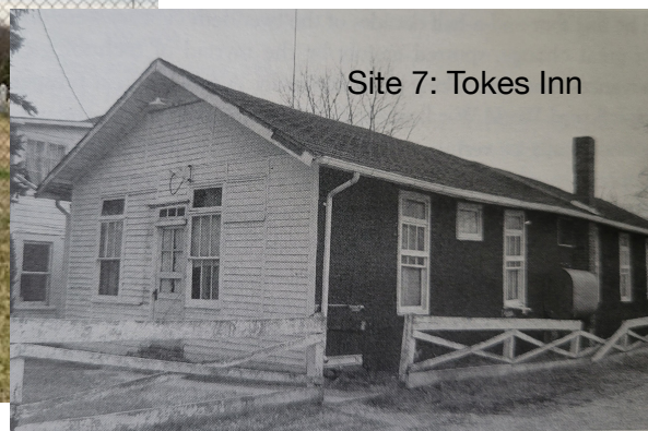
Site 7: Tokes Inn